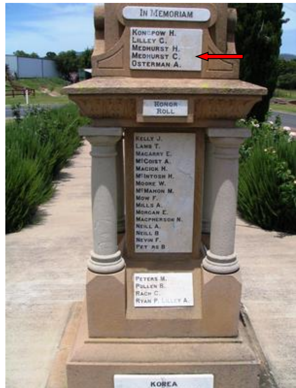
Killarney War Memorial